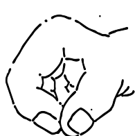
Bent thumb and forefinger in circle