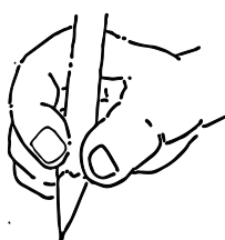
Put pencil sandwiched between thumb and forefinger